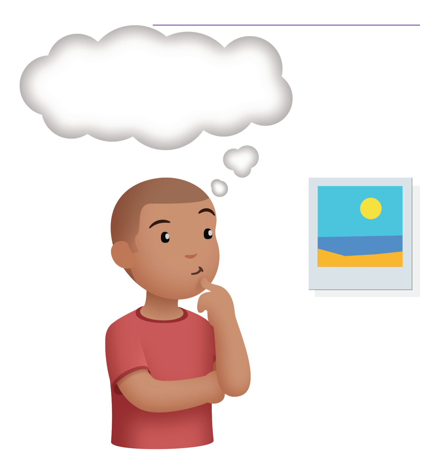
Shake and Spill