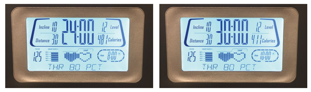
1. What is the same about their workouts? What is different about their workouts?

2. If each person ran at a constant speed the entire time, who was running faster? Explain your reasoning.