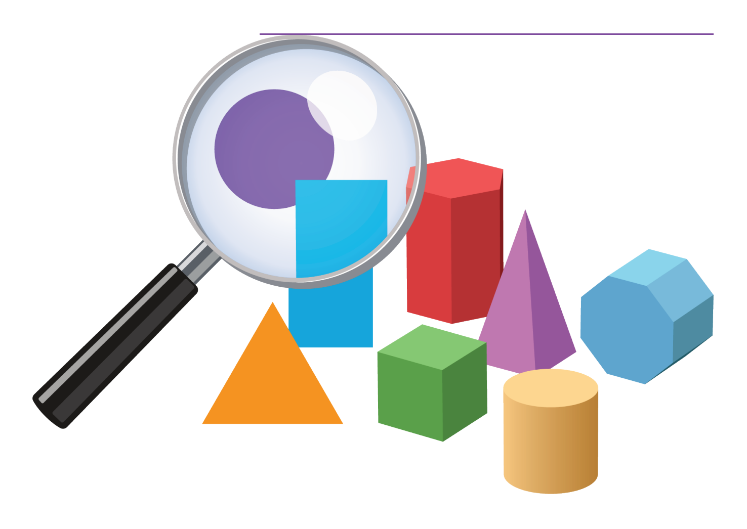
Can You Draw It?